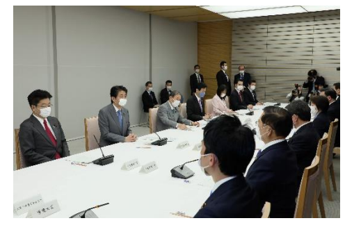
Cabinet members meeting