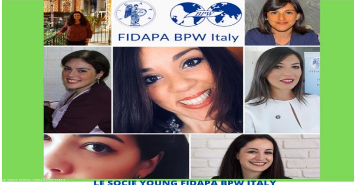
Si uniscono all'invito della Presidente Nazionale e di tutto il CPN: BISOGNA STARE A CASA PER FERMARE IL CORONAVIRUS! E' l'atto di amore per la vita che si deve fare nel rispetto per coloro che sono instancabilmente impegnate/i in prima linea contro la pandemia che sta particolarmente provando l'Italia.

Starting from the Young Bpw, who joined the message sent from the National President to encourage all members to stay home to be safe;